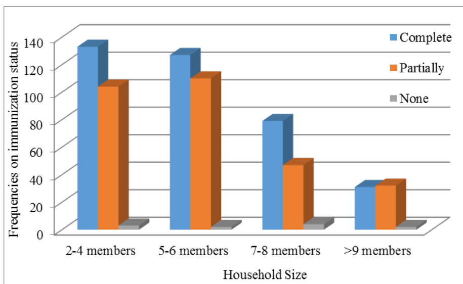
Figure 2: Under-Five Child Immunization Status with Reference to the Household Size.